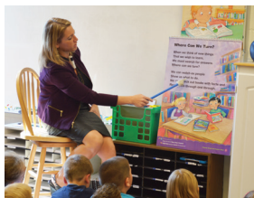
“She’s really cool—best teacher in the world.” — Westside Elementary Student.

The woman who always wanted to be teacher has fulfilled her dream and continues to put her passion to work—for her students in the classroom and for her colleagues as the president of the Idaho Falls Education Association.